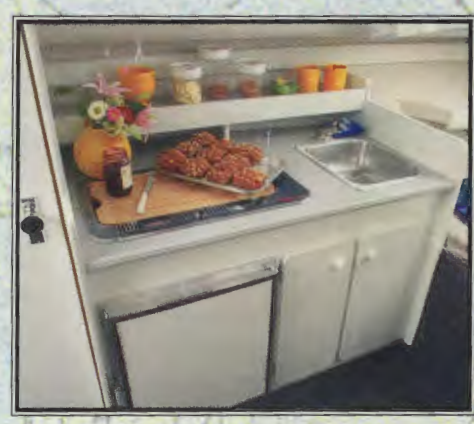
Alcohol stove, sink, icebox and storage cabinet complete the compact galley;