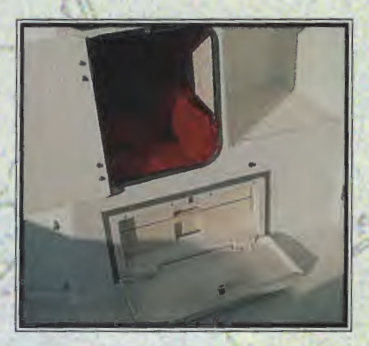
There's plenty of storage in the selfbailing innerliner cockpit.

boating comfort and safety...at a surprisingly affordable price.