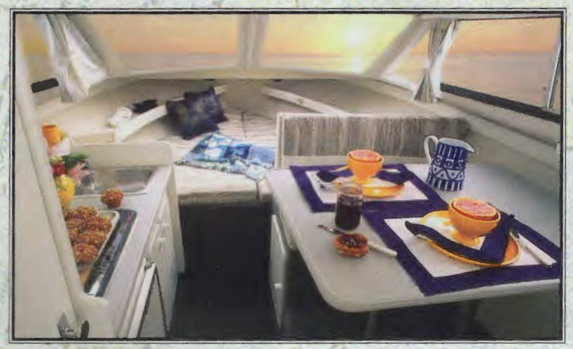
The salon houses V-berth, convertible dinette, enclosed head compartment with marine tollet.